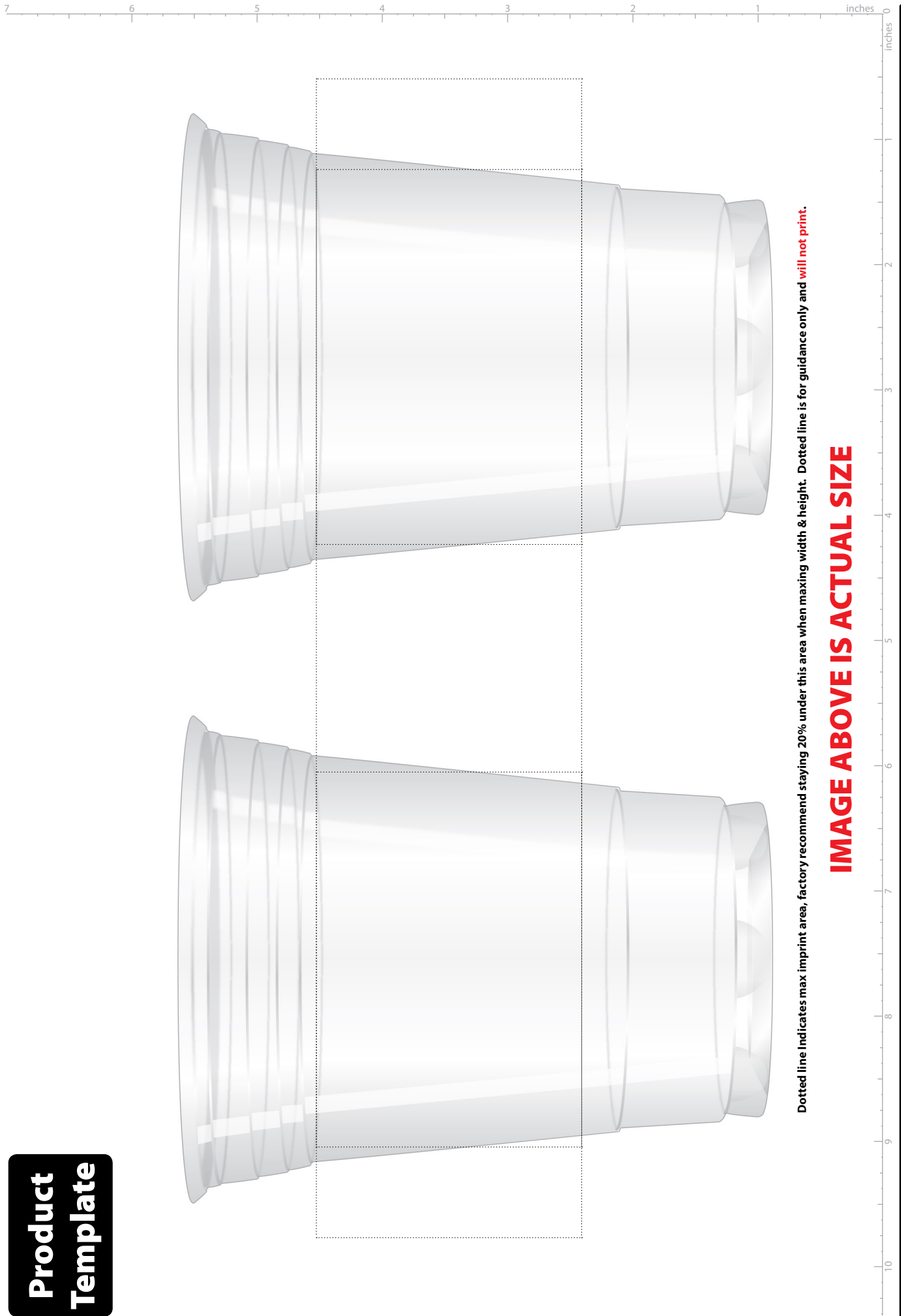
IMAGE ABOVE IS ACTUAL SIZE

Dotted line indicates max imprint area, factory recommend staying 20% under this area when maxing width & height. Dotted line is for guidance only and will not print.